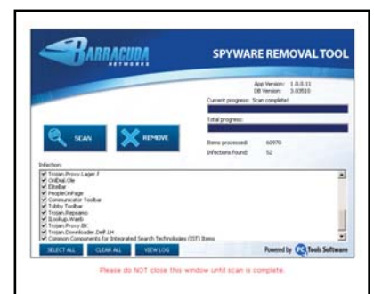
Spyware Removal Tool