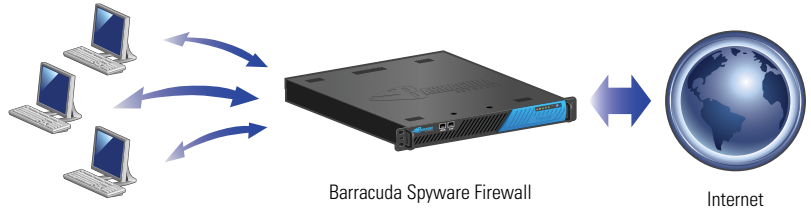
Barracuda Spyware Firewall